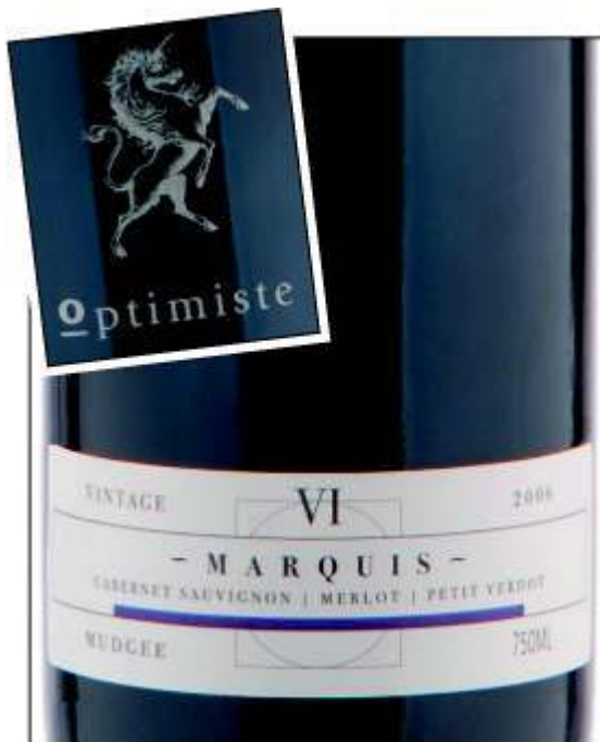
HOPE AND PASSION: New label Optimiste's Marquis wine is dedicated to the maker's son

Tropical fruit notes from the sauvignon blanc component and herbal gooseberry and nectarine from the semillon make this an ideal wine for al fresco dining, one that's got chuck-another-shrimp-on-the-barbie written all over it. So, pay $18.99, gather some mates and do just that.